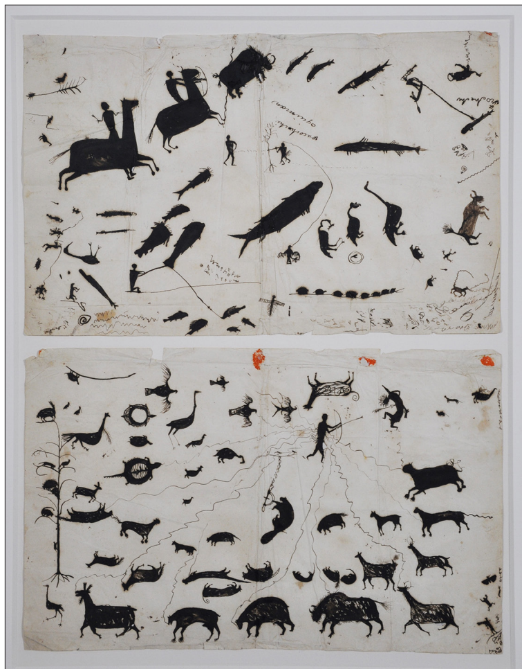
A Meskwaki pictograph, circa 1830.