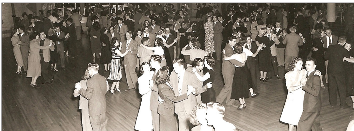
The Surf Ballroom in 1948.