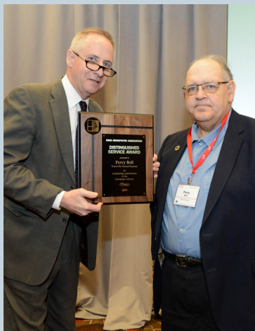
PERRY BELL Knoxville Journal Express