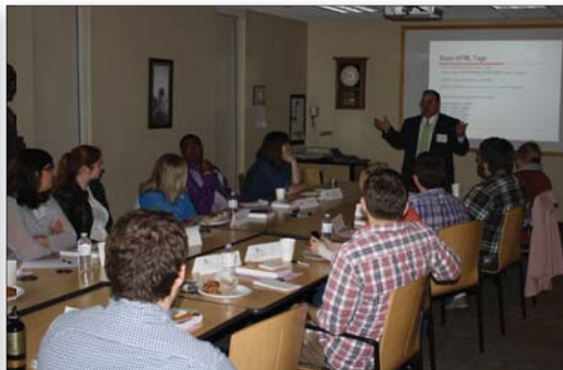
Mauck-Stoufer Professional Writer Improvement Workshop