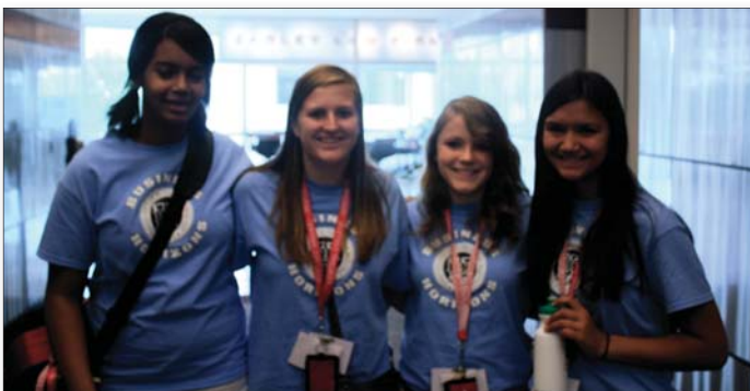
Business Horizons Media Experience