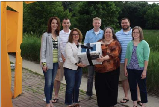
Leo Mores Newspaper Leadership Institute Retreat

Thank you for supporting the Iowa Newspaper Foundation in 2013. The dozens of programs, webinars, workshops and events presented by the INF would not be possible without your support!